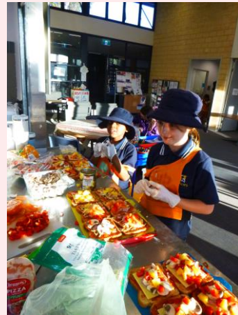
Snack Squad prep.