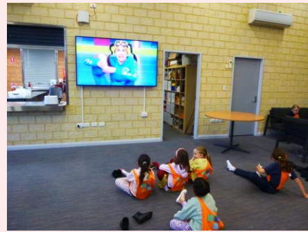
Zen masters - Cosmic yoga